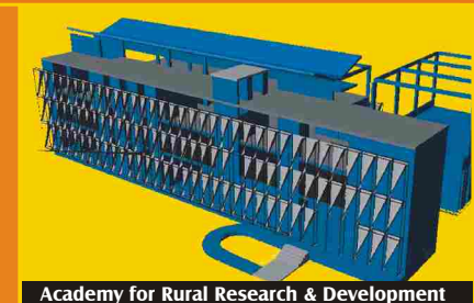
Academy for Rural Research & Development

After successful implementation of the ISVD model in select villages, we are now ready to replicate this model in other villages through Village Champions (VC) . We believe that the driver behind sustainable development is the VC. VCs are individuals chosen from the villages who are eager to take part in village development and who also demonstrate the leadership attributes necessary to motivate the community.